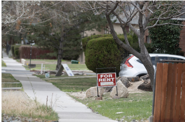
Housing for rent in Reno on April 7, 2025.