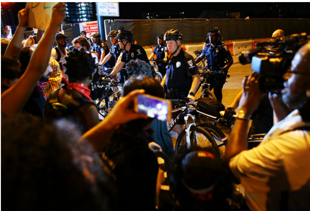
Protesters confront police officers during another night of protests over the police shooting of Keith Scott in Charlotte, North Carolina, Sept. 25, 2016.

In Mills v. Alabama , the U.S. Supreme Court wrote in 1966 that the Constitution “specifically selected the press . . . to play an important role in the discussion of public affairs. Thus, the press serves and was designed to serve as a powerful antidote to any abuses of power by governmental officials, and as a constitutionally chosen means for keeping officials elected by the people responsible to all the people whom they were selected to serve.”