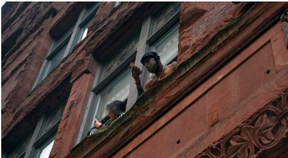
A man records the protesters marching during a protest against the death in Minneapolis police custody of George Floyd, in St. Louis, Missouri, June 1, 2020.

However, as the First Circuit in Glik held, “peaceful recording of an arrest in a public space that does not interfere with the police officers’ performance of their duties is not reasonably subject to limitation.”