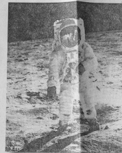
American on the Moon (in color) 11125