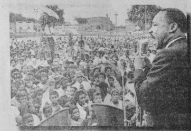
Dr. Martin Luther King 11200