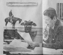
Ronald Reagan 11160