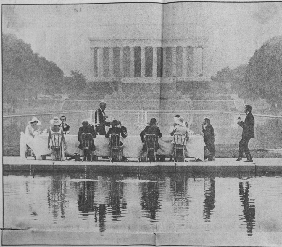
"A midsummer morning catered affair of extraordinary elegance in the midst of the Washington Monument, Lincoln Memorial . . . 6:30 in the morning is a peaceful time to hold a formal breakfast."