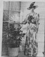
Elaine Roosevelt 11127