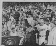
Daight Eisenhower Throws Out First Pitch 11137