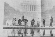
Dinner Party—Reflecting Pool 11186