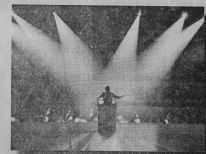
FK in Spotlight 11152