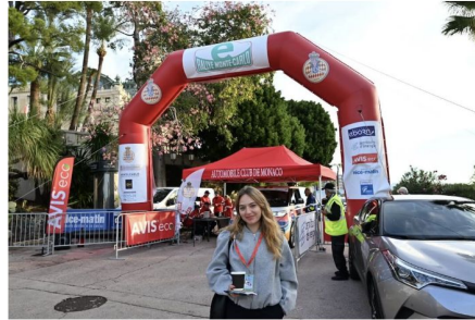
The author at the starting line of the Monte Carlo Electric Rally in Monaco in October 2023.

The issue with younger generations is deeper than media mistrust. It's that no one knows what a journalist is.